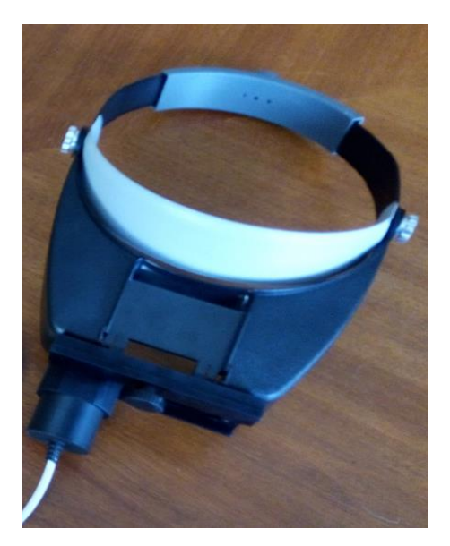
Figure 2. Photo of the prototype of the apparatus - component that allows functional attachment of the UV light source to the head of the patient.

The matrix-LEDs emits a total cut-off power of 40 mW at a wavelength of \lambda = 390 \pm 5 nm. Using a widget, the matrix is moved to the left or right eye. Figure 2 represent a photo of the module attachable to the patient's head.