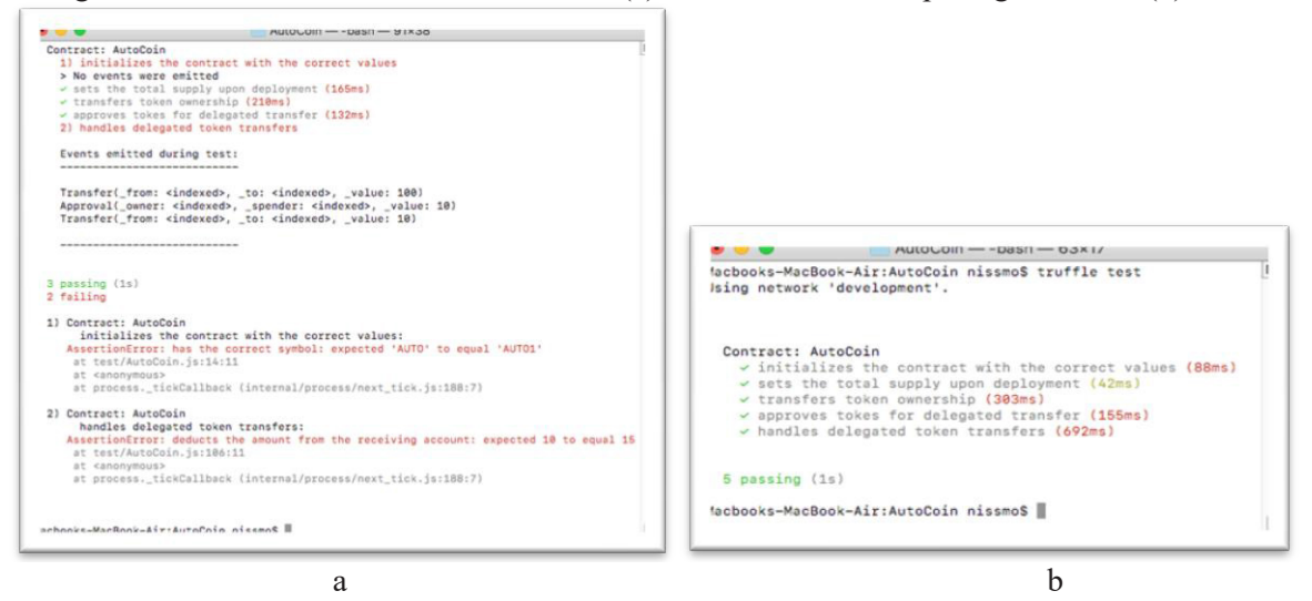
Figure 6. Code of test for transfer of tokens (a), Code of test for disposing of tokens (b).