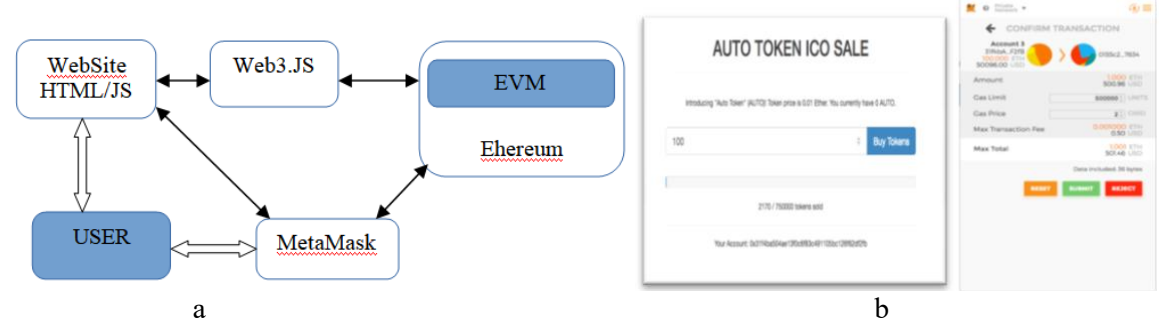
Figure 4.Architecture (a) and interface (b) of application.

Architecture of application is presented on Fig.4a. The implementation of the ERC20 standard guarantees the smart-contract free movement between the participants in the Ethereum network. The proposed solution was developed with Truffle and Ganache under the MacOS High Sierra operating system. Ganache creates a local block-chain based on Ethereum, which can directly execute commands as well as perform tests.