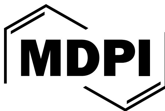
Figure 1. This is a figure. Schemes follow the same formatting.

All figures and tables should be cited in the main text as Figure 1, Table 1, etc.